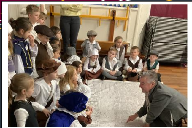
Year 2 travel back in time to 1666...