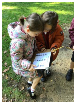
Y1 Bird Hunting around the school grounds