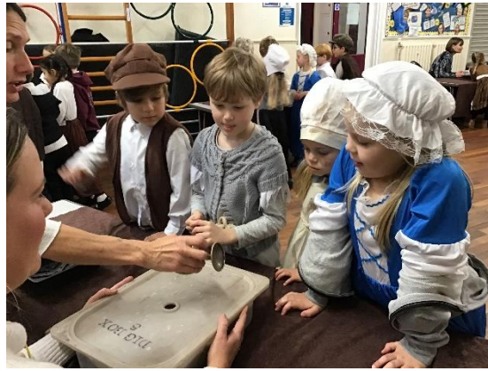
Lots of learning and fun at the Great Fire of London Day with Year 2 and History Off the Page!